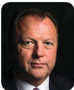
Marius L. VIZER IJF President

The Paris Grand Slam is one of the most spectacular events on the World Judo Tour and takes place this year from 17-18 October.